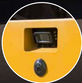
6. BACKUP CAMERA AND REVERSE SENSING SYSTEM