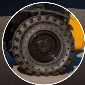
7. CUSHIONED SOLID TIRES