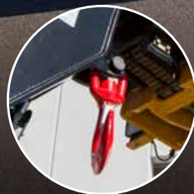
8. LED BOOM WORK LIGHTS AND LIFT HOOK