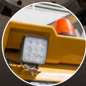
5. FRONT AND REAR LED CAB LIGHTS AND BEACON