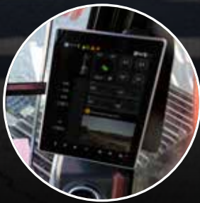
4. 10.4" HD DISPLAY