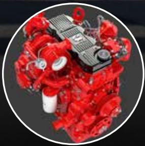
2. POWERFUL CUMMINS ENGINE