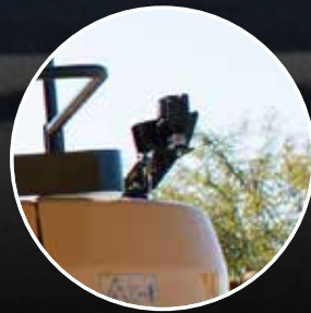
7. BACKUP AND RIGHT SIDE SAFETY CAMERA AND SR285MV HAS AN ADDITIONAL MAIN WINCH CAMERA