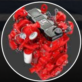
2. POWERFUL CUMMINS ENGINE