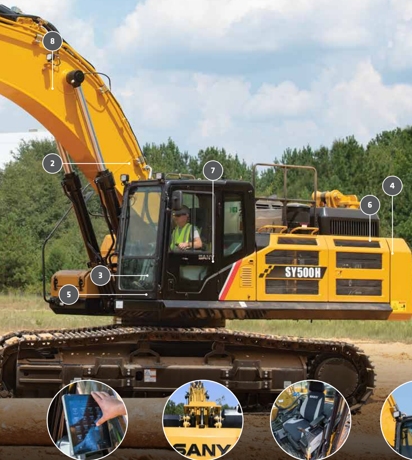
5. LARGE TOUCHSCREEN DISPLAY ON SY385C & SY750H MODELS