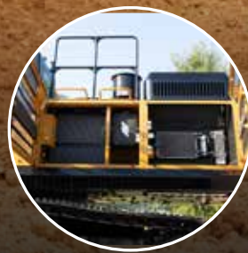
3. REVERSIBLE HYDRAULIC SYSTEM COOLING FAN