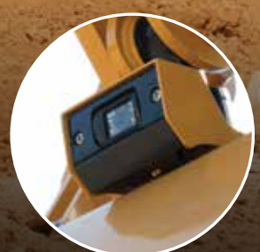
4. REAR VIEW CAMERA ON ALL MODELS & BLIND SIDE CAMERA ON SY385C & SY750H