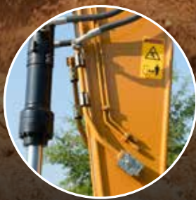
2. 1-AND 2-WAY PRIMARY & 2-WAY SECONDARY AUXILIARY CIRCUITS