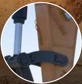
1. QUICK COUPLER PLUMBING TO END OF STICK