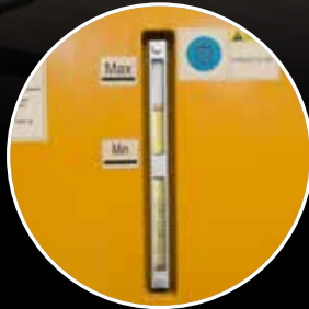
8. DUAL HYDRAULIC TANKS