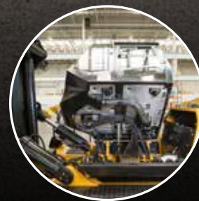
4. POWER TILTING CAB