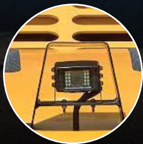
1. REVERSE CAMERA AND RADAR DETECTION SENSORS