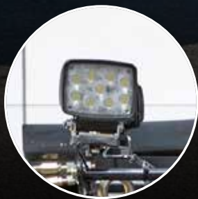
2. LED WORK LIGHT PACKAGE