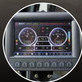
7. ON-BOARD DIAGNOSTICS