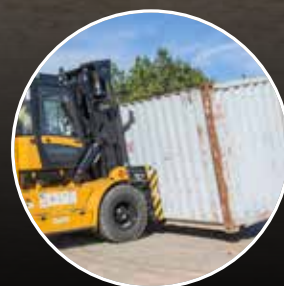
8. LIFT OVERRIDE PROTECTION