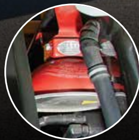
3. DRY CHEMICAL FIRE SUPPRESSION SYSTEM