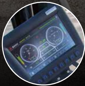
6. PRESSURE TRANSDUCER TO DISPLAY LOAD BEING PICKED UP