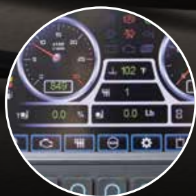
5. PRESSURE TRANSDUCER TO DISPLAY LOAD BEING PICKED UP