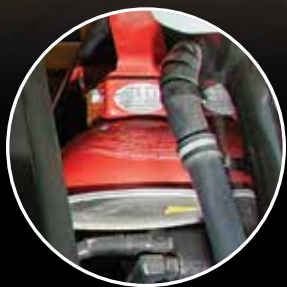
2. DRY CHEMICAL FIRE SUPPRESSION SYSTEM