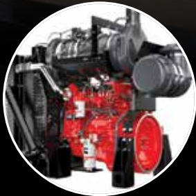
6. COOLDOWN PERIOD TO ALLOW TURBO TO COOL BEFORE SHUT DOWN