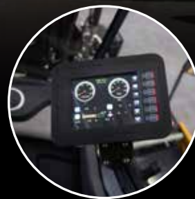
4. LOAD SENSING HYDRAULICS