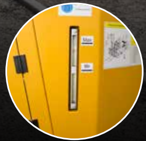
8. DUAL HYDRAULIC TANKS