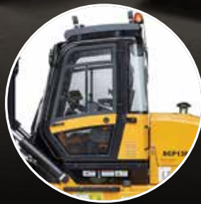
3. POWER TILTING CAB