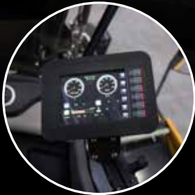
5. PRESSURE TRANSDUCER TO DISPLAY LOAD BEING PICKED UP