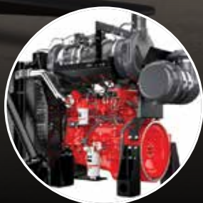
6. COOLDOWN PERIOD TO ALLOW TURBO TO COOL BEFORE SHUTTING DOWN