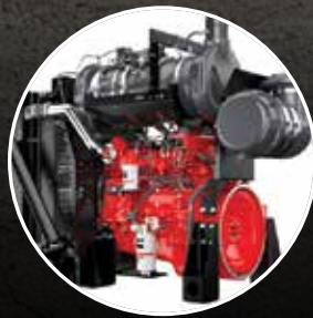
7. COOLDOWN PERIOD TO ALLOW TURBO TO COOL BEFORE SHUTTING DOWN