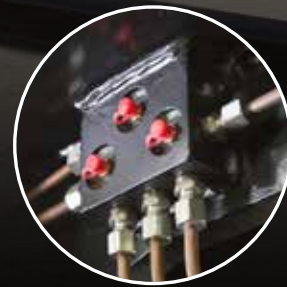
4. CENTRALIZED GREASING POINTS FOR THE MAST AND STEERING PIVOT PIN