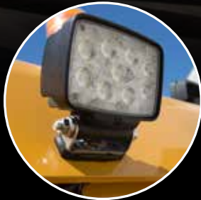
7. LED WORK LIGHT PACKAGE