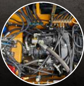
5. LOAD SENSING HYDRAULICS