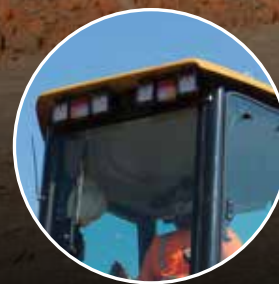
4. ROPS/FOPS-CERTIFIED CAB (ISO-3471, ISO- 27850, ISO-3449)