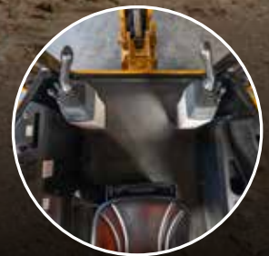
8. OPTIONAL CLIMATE-CONTROLLED CAB OR CANOPY