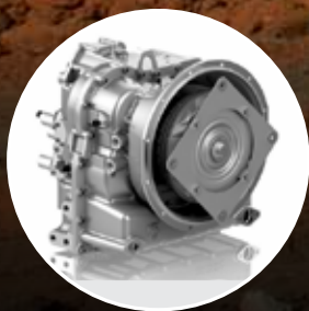
1. 4WD ZF POWERSHIFT TRANSMISSION