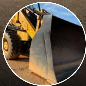
6. BUCKET FLOAT AND RETURN-TO-DIG FUNCTIONALITY