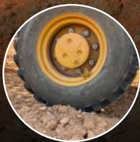
2. LIMITED SLIP DIFFERENTIAL