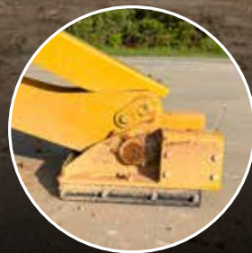
7. FLIP-OVER PADS AND OUTRIGGER CYLINDER GUARDS