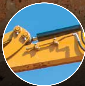
3. AUXILIARY CIRCUIT BREAKER LINE