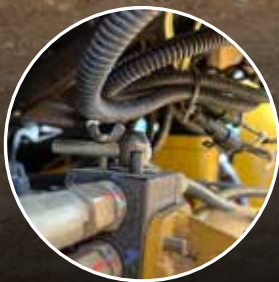
5. LOAD-SENSING HYDRAULICS WITH ISO/SAE PATTERN CHANGE