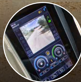
7. NEW TOUCHSCREEN DISPLAY ON SY75C AND SY135C