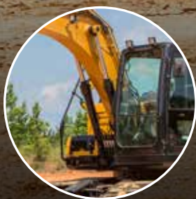
2. FIXED BOOM FOR INCREASED LIFTING PERFORMANCE