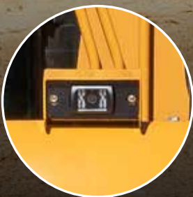
5. REAR VIEW CAMERA