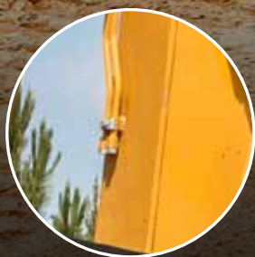
1. QUICK-COUPLER PLUMBING TO END OF STICK