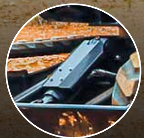
8. BLADE CYLINDER GUARDS AND TRACK GUARDS