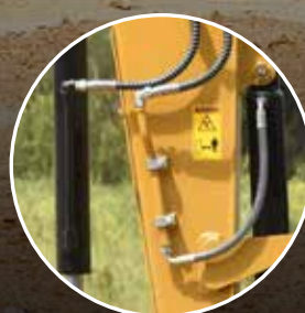
3. 1- AND 2-WAY PRIMARY AUXILIARIES ON SY75C AND SY95C