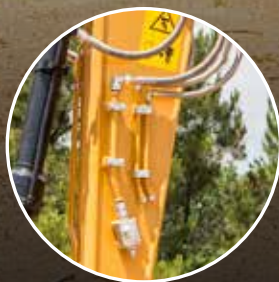
6. 1- AND 2-WAY AND A SECONDARY AUXILIARY CIRCUIT AND CASE DRAIN