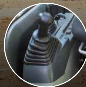
4. HYDRAULIC PILOT CONTROLS WITH PATTERN-CHANGE SELECTOR