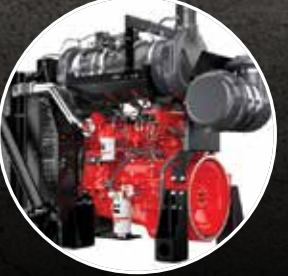
7. COOLDOWN PERIOD TO ALLOW TURBO TO COOL BEFORE SHUTTING DOWN