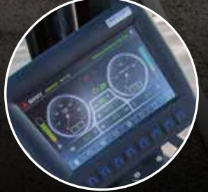
6. PRESSURE TRANSDUCER TO DISPLAY LOAD BEING PICKED UP