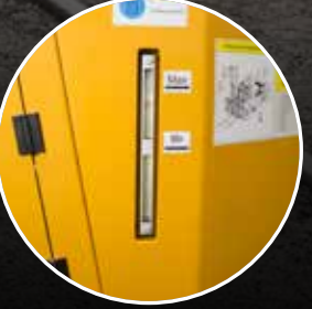
8. DUAL HYDRAULIC TANKS