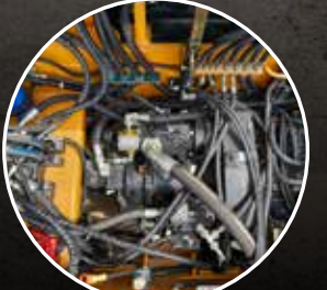
5. LOAD SENSING HYDRAULICS