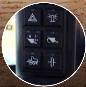
1. RIDE CONTROL