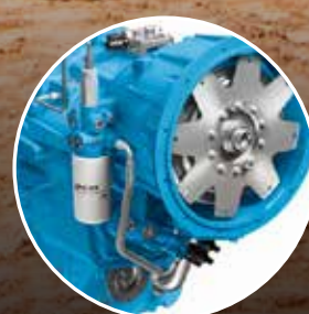
4. POWERSHIFT TRANSMISSION