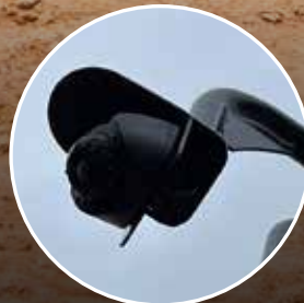
6. 360 DEGREE CAMERA & REAR VIEW CAMERA