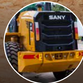
7. REVERSIBLE FAN