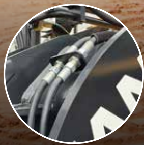
2. THIRD-FUNCTION AUXILIARY PLUMBING