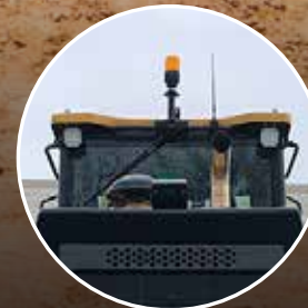
8. WORK LIGHT PACKAGE & BEACON