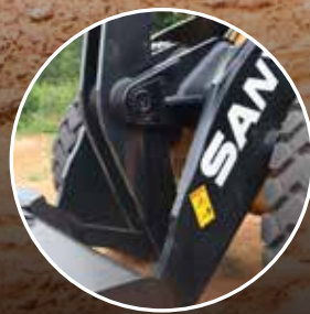
3. Z-BAR LINKAGE