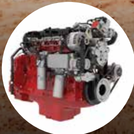
5. DEUTZ ENGINE